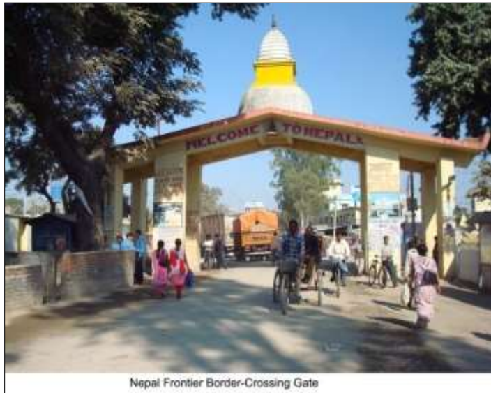
Nepal Frontier Border-Crossing Gate