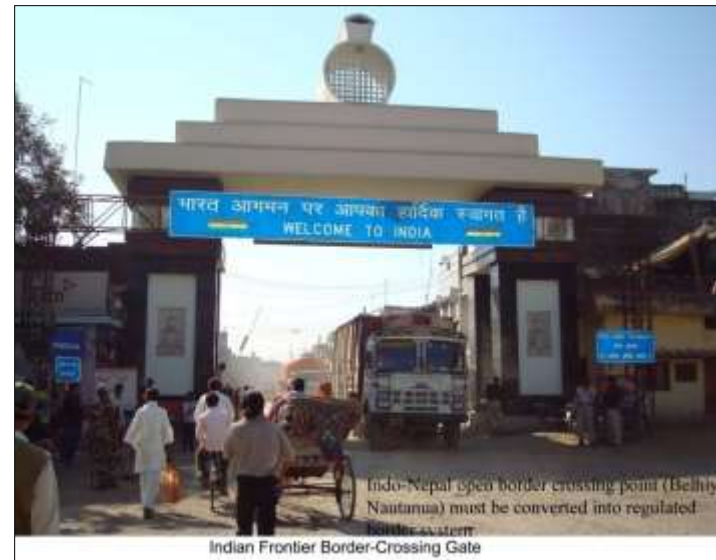
Indo-Nepal open border crossing point (Belhity Nautanua) must be converted into regulated border crossing point. Indian Frontier Border-Crossing Gate