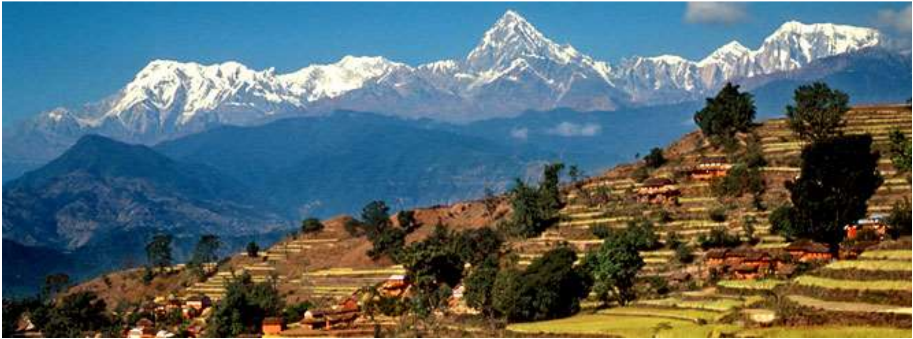
Panoramic view of hilly area of Nepal