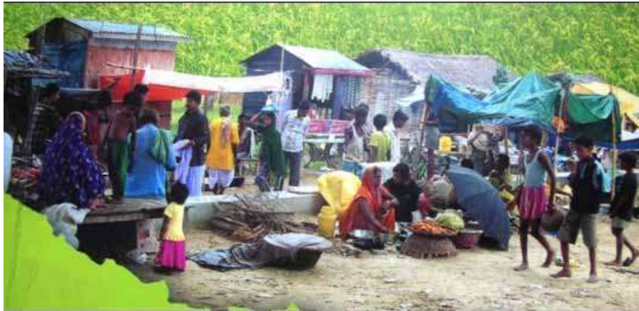
Nepal-India Weekly Open Market, Hari Bansa Jha (2010), The Economy of Terai Region of Nepal, cover page