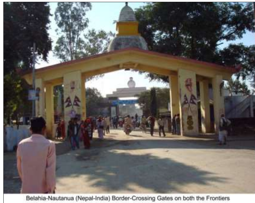
Belahia-Nautanua (Nepal-India) Border-Crossing Gates on both the Frontiers