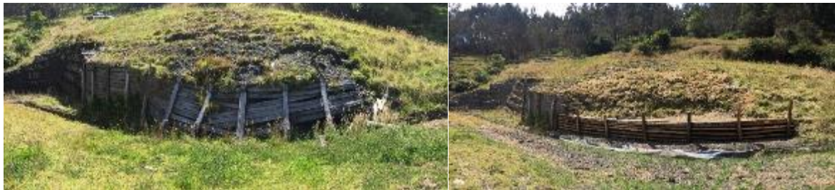
Before and after the coformation of the ditches for surface water management: