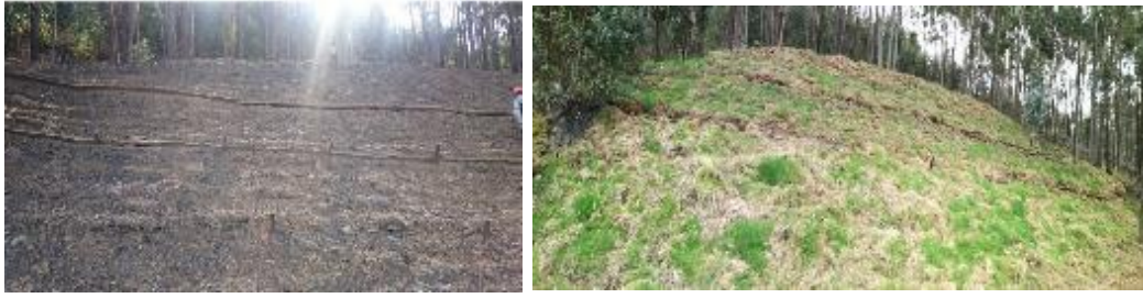
Before and after support stabilization