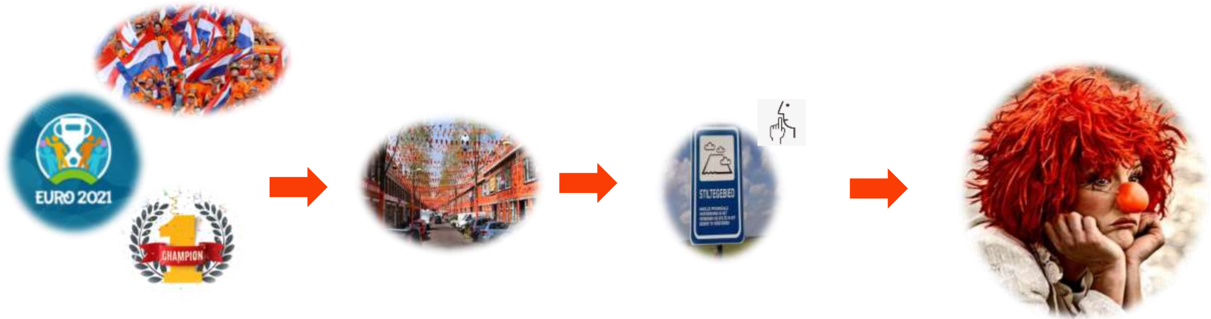
Supreme Dutch EK winner 2021!