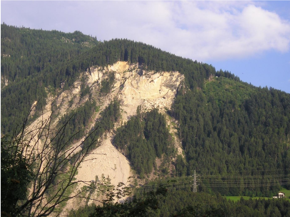
Figure 1: The Eiblschrofen in 2006

A major mass movement was the fall at the Eiblschrofen in 1999. Approximately 150,000 m 3 rock detached from their foundation and moved towards the village of Schwaz. One effect was the blocking of the Starckenbach on a length of 600 m which could have resulted in a change of the riverbed. Figure 1 shows the effect of the fall on the mountain.