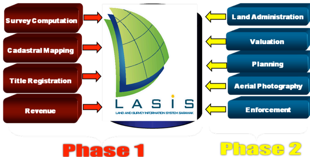
Figure 2: Land and Survey Information System (LASIS)