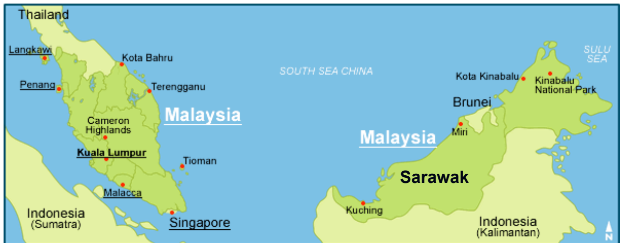
Figure 1: Map of Sarawak, Malaysia

Sarawak is located on the western region on the island of Borneo. It is the largest state in Malaysia, covering an area of 124,450 square kilometers and had a population of 2.4 million of various ethnic groups. At present, it is divided into 11 administrative divisions; Kuching, Samarahan, Sri Aman, Betong, Sarikei, Sibul, Kapit, Bintulu, Mukah, Miri and Limbang. Kuching is the State capital and seat of the government.