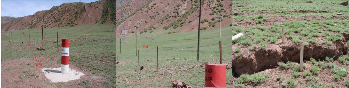
Figure 3. The crack of near SK105 point

points were stable relatively. After the field exploration, we found that there was a crack (width of about 8 cm, length of about 200 m) along the mountain body and the distance from the crack to SK105 point was about 100 m, as Figure 3 shows.