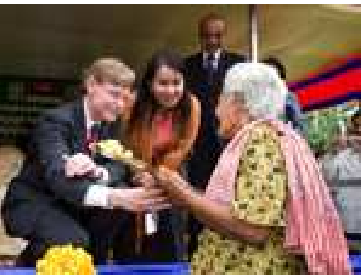
At the land title distribution's ceremony

We are always welcome delegations from other countries to visit us and exchange experiences on land sector.