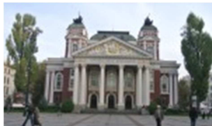
The Ivan Vazov National Theatre that is used in the 2015 Working Week logo

It is our privilege and honour to invite you to the FIG Working Week 2015 to be held from 17 to 21 May 2015 . The Working Week is hosted by the International Federation of Surveyors, FIG and the Chamber of Graduated Surveyors, Bulgaria as the local host. Our Bulgarian colleagues are experienced professionals and great hosts as they have had the leadership of FIG and have successfully organized several memorable international events, FIG Commission workshops and the FIG Congress in 1983. The FIG Working Week 2015 is locally supported by all relevant local major sectors, such as the academia, the government and the private practitioners.