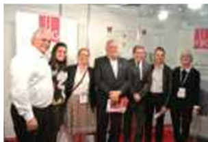
A Delegation from Brazil visiting the FIG Stand at InterGeo