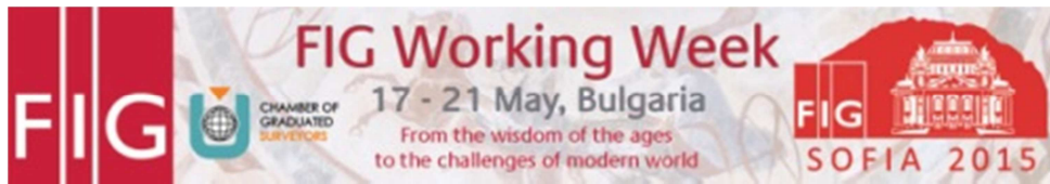
FIG Working Week 2015 – Submit your abstract – deadline 15 November