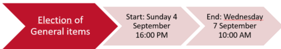
FIG GENERAL ASSEMBLY SESSION 2 11 September 2022 13:00 – 15:30 in Warsaw Poland