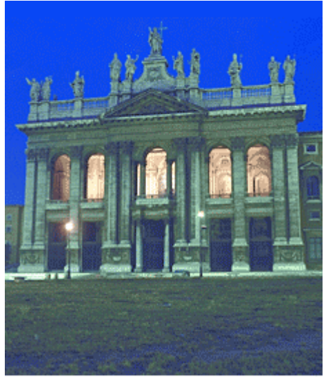
Rome: San Giovanni in Laterano

The most spectacular churches in the Eternal City: