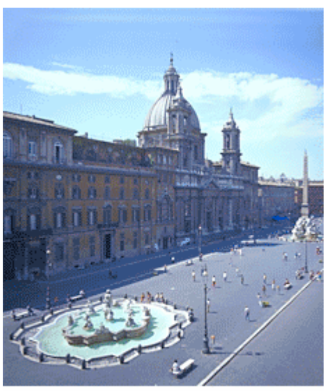
Rome: Piazza Navona