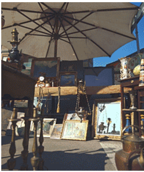
Rome: Porta Portese

recommend Caffè Sant'Eustachio located in the square with the same name, a fine coffee shop founded in the 1930s where the coffee is roasted by hand over wood fires.