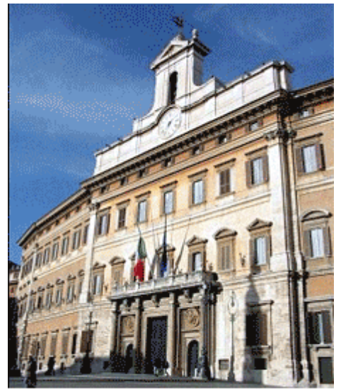
Rome: Palazzo Montecitorio