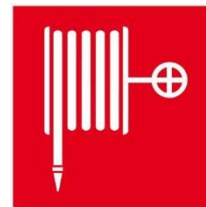
Fire hose reel