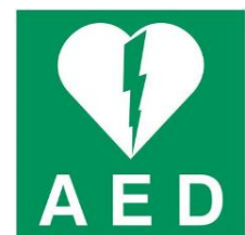
Figure 3: AED