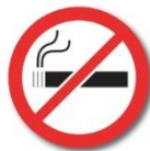
Figure 1: No Smoking