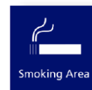
Figure 2: Smoking Area