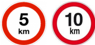
Maximum speed 5/10 kilometres per hour