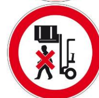
Do not walk under the load