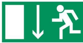
Emergency escape route