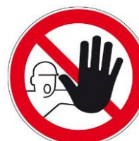
No access to unauthorised persons