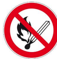
Naked flame prohibited