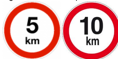
Figure 6: Maximum speed