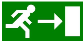
Figure 5: Emergency exit