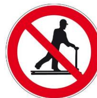
Scooting on a pump truck is prohibited